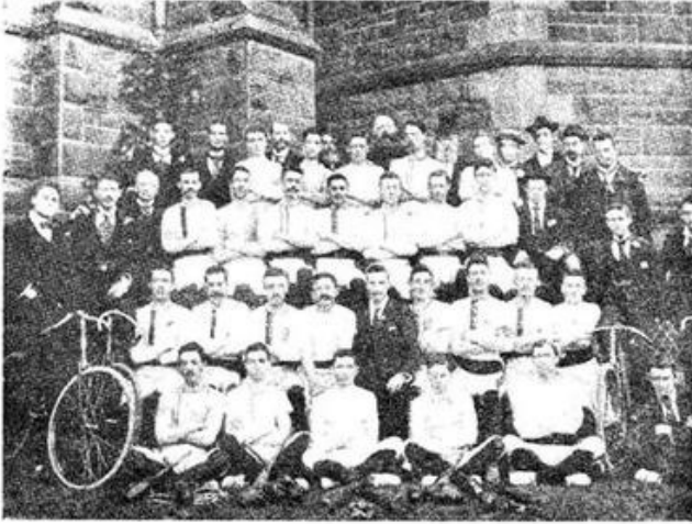
GROUP OF ATHLETIC CLUB MEMBERS.

Clergy seen at Vestry Thursday, noon; Friday, 8.30 p.m.; after Services, and by special appointment.