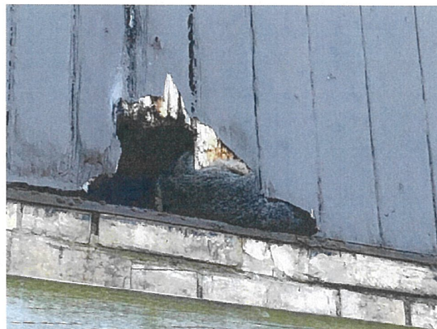
Local wildlife inhabiting the decayed Old Vicarage verandah

The inspection and architect report on the water ingress and structural damage to the Curate's residence porch area over the OVPC has been received and the incoming parish council will consider this work commencing over the coming 12 months.