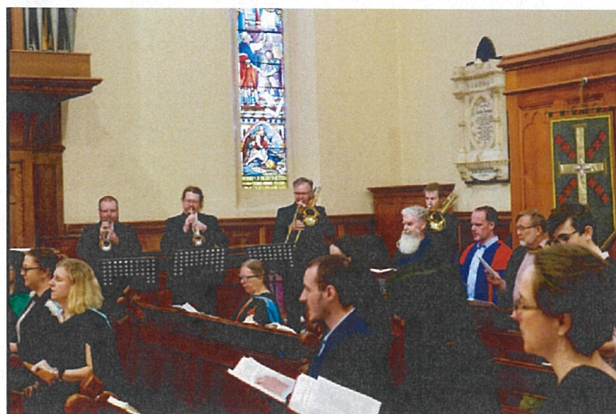
Easter Day Musicians