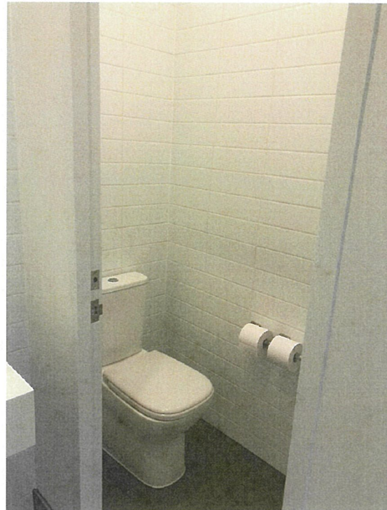
The refurbished church toilets